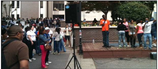
GSU student leaders proclaiming Christ in the courtyard

THANK YOU for your partnership . We <u>greatly need</u> your prayer and financial support as we can't fulfill our mission on the campus without your help! Have a great month and please let us know if we can be of service.